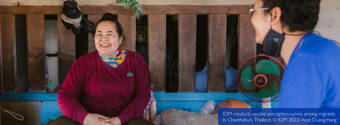
IOM conducts vaccine perception survey among migrants in Chanthaburi, Thailand.