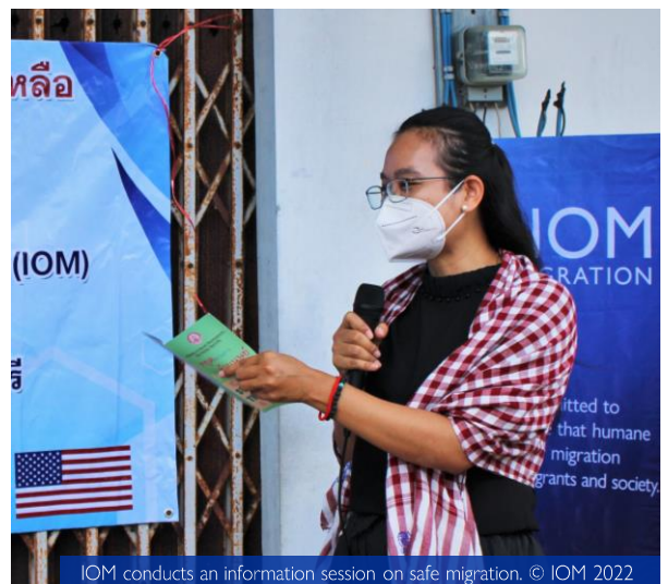
IOM conducts an information session on safe migration.

International Organization for Migration (IOM) in Thailand