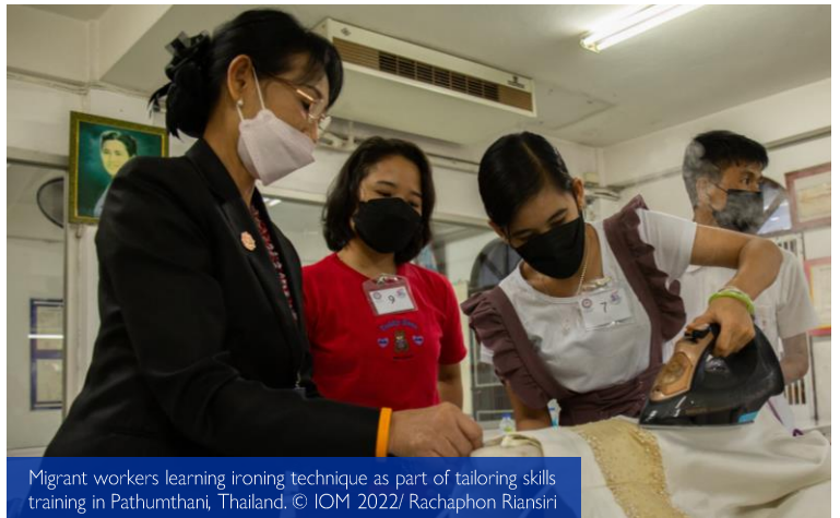
Migrant workers learning ironing technique as part of tailoring skills training in Pathumthani, Thailand.

Great strides were also made on migrant inclusion in skills development, with the Ministry of Labour encouraging employers to invest in the Skills Development Fund for migrant workers. In 2022, over 163,620 migrant workers from Cambodia, Lao People's Democratic Republic and Myanmar benefitted from in-service training funded and conducted by their employers.