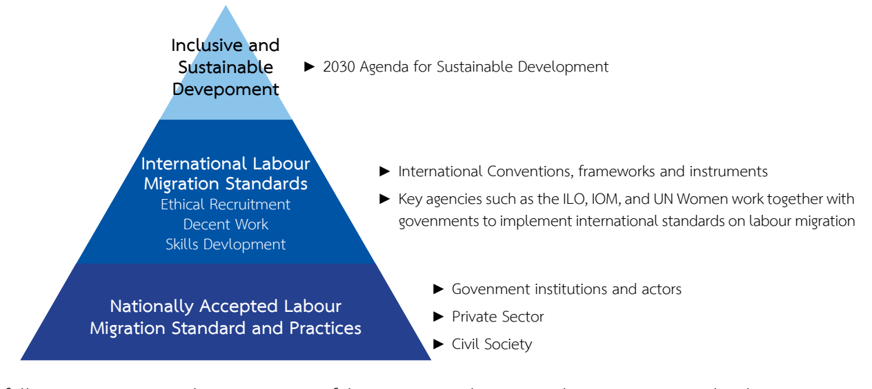
Figure 1: Conceptual Framework on a Shared Responsibility Framework on Ethical Recruitment, Decent Employment and Skills Development.

The following section provides an overview of the international norms and instruments on ethical recruitment, decent employment and skills development for migrant workers in addition to Thailand's key national laws and regulations relevant to migrant workers. Thailand's current status as a destination country for migrant workers and how its labour migration laws, policies and programmes measure up against international benchmarks is then examined. As we undertook this literature review, the COVID-19 spread globally. Its health and socioeconomic effects have become more evident in Thailand, including among the migrant worker populations. Hence, we have identified emerging issues concerning migrant workers' rights and welfare that have emerged from this pandemic, as well as potential policy response measures to address similar emergency and crisis situations in the future.